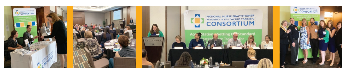
Shown above, 2019 Conference. See article on page 4.