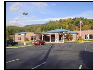
ETSU CON Mountain City Extended Hours Health Center