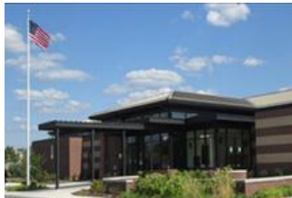
ETSU CON Johnson City Community Health Center