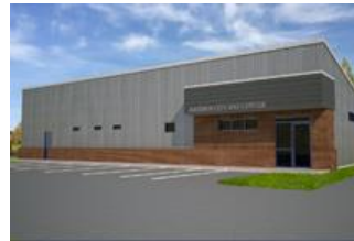
ETSU CON Johnson City Day Center